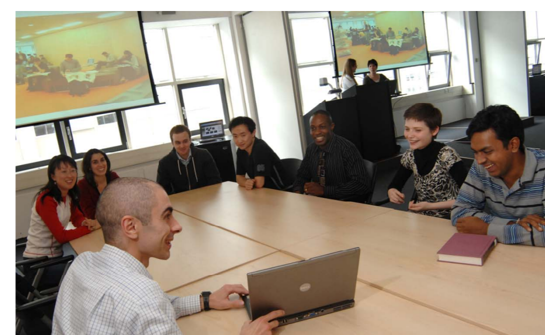
Seminar rooms in open configuration

The Research Exchange provides a number of environments to meet different needs: open-plan collaborative study spaces, quieter and more formal study accommodation, social and break-out areas, and three bookable seminar rooms for research-focused workshops, conferences and other events. The seminar rooms are also highly configurable, with retractable walls allowing for larger groups and even conferences of up to 90 participants.