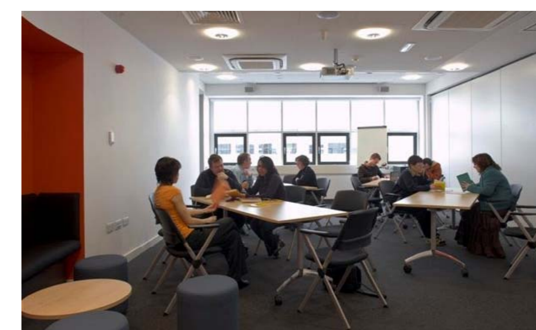
Seminar rooms in closed configuration